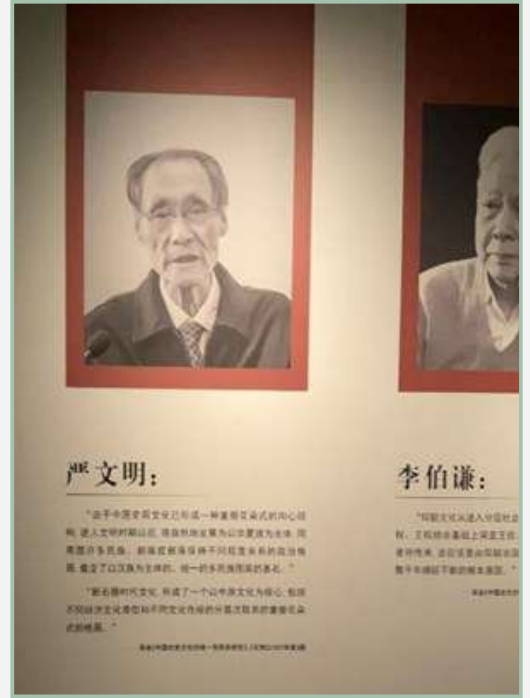
Figure 3. The row of archaeological ancestors. The Ordos Museum

archaeology section, these lengthy accounts of the discipline provided legitimacy, or, as we suggested above, trust. The material on display is understood as the product of generations of scholarly work through which our disciplinary competence has accumulated and grown. Rather than emphasising the history of the museum collection, as is so often now done in European museums, the material on display was to be understood as the result of scholarly work – the legitimacy of the display and its interpretation is stressed as based on scientific work and the skills of scholars.