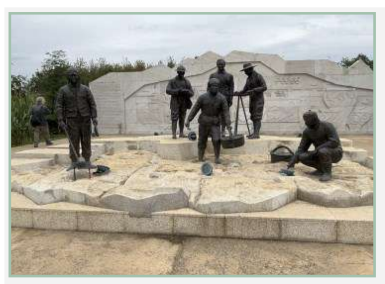
Figure 2. The statue group marking the 1921 excavation at the Yangshao Village site, Henan Province, China.

Using the format of a memorial tableau importance is clearly granted to the excavation and the excavators. Moreover, in its location, the statue group is used to stress that it is here, on this spot, that the Neolithic was first discovered. This adds gravitas to the site, creating an aura of authenticity while stressing the human endeavour that went into this.