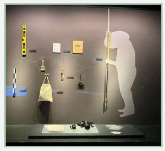
Figure 6. The archaeological tool kits on display. Ordos Museum

Similarly, the display of primary documents such as archaeologists' field notes and original reports acts as proof furthering the public's trust, promoting