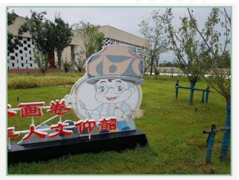
Fig. 1 Imaging the archaeologist. One of the installations along the path leading to the Miaodigou Museum, Henan province, China

A striking aspect of the archaeological museum we visited during our recent fieldtrip was how pronounced archaeology as a discipline with practitioners appears in many recent museum exhibitions and archaeological parks.