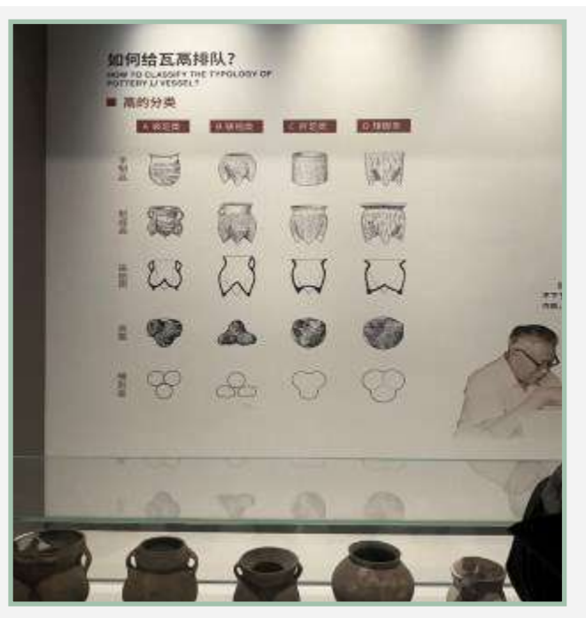
Figure 5. Accounting for the archaeological method of typological determination, Shaanxi Archaeological Museum