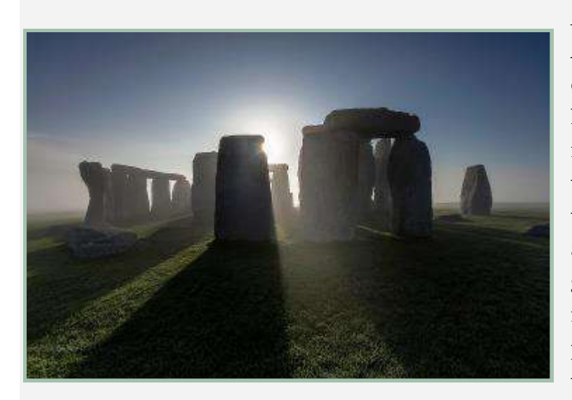
Stonehenge at dawn.

What can the human skeleton tell us about life of people in the past? Our osteoarchaeologists will show you how we create osteobiographies of the dead through respectful scientific examination of bones to learn about age, sex/gender, burial treatment, occupation, and diet and health, through hands-on activities. Lead researcher: <u>Dr Trish Biers</u>