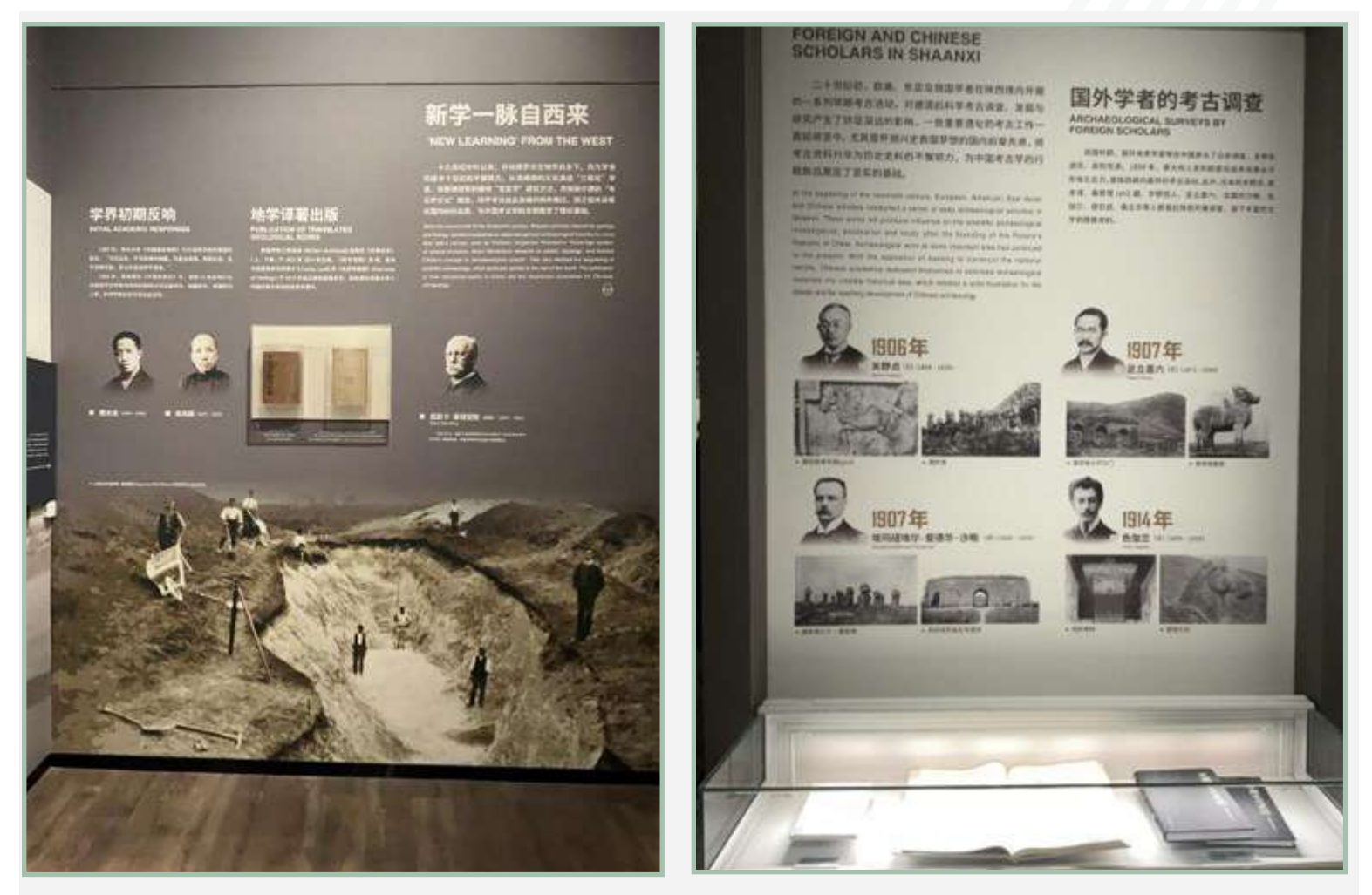
Figure 4. Examples of explicit accounts of the history of archaeology and the role of individuals within it. The montage on the left includes a photo of Pitt River's Wor Barrow excavation. Both images from the Shaanxi Archaeological Museum (photo M.L.S. Sørensen)

The other obvious theme – archaeology as a discipline follows naturally after this. Not only the archaeologists and their endeavours were presented, but core archaeological ideas were also explained, such as stratigraphy. Typology was, for instance, explained in detail at several museums, with clear links between the theoretical concept and examples of actual pots. Here the archaeological craft was explained and displayed, furthering the notion of the exhibition being based on scholarly work and expertise. Moreover, this expertise, rather than simply assumed was augmented by the