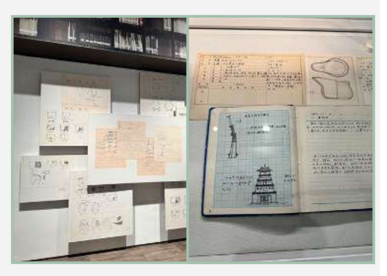
Figure 7: Archaeologists' field notes and original reports displayed in the Shaanxi Archaeological Museum.

transparency and offering visitors insight into the meticulous processes behind archaeological objects, see Fig. 7. The sharing of these sources also reinforces the authenticity of the artefacts and information presented and thus provides support for the interpretations offered. Overall, these features – disciplinary conduct, the provision of proof, and sharing records - enhance notions of authenticity and create trust.