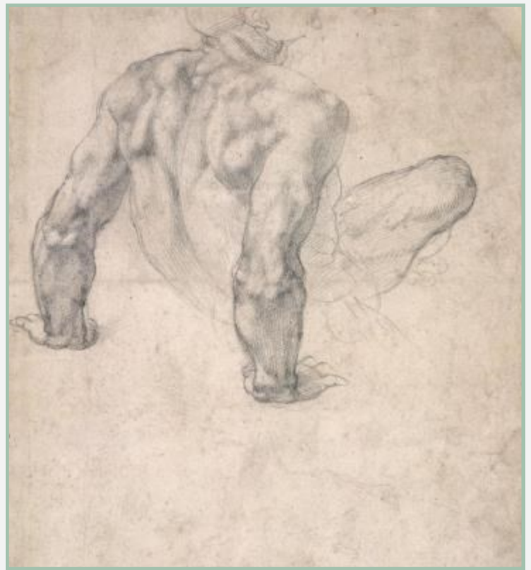
Image: Michealangelo Buonarroti (1475–1564), study for the ‘Last Judgement’.

most striking works of his career. Forceful preparatory drawings for the Last Judgment as well as the recently conserved Epifania – one of only two surviving cartoons by Michelangelo – show his renewed energy and desire to challenge himself. These works are displayed alongside studies for Michelangelo's grand architectural projects as well as drawings, poems and intimate letters that reveal his personal passions and anxieties. Rather than showing an artist in decline, this exhibition shows the astonishing dynamism that Michelangelo brought to his work in the final decades of his life as he explored salvation and confronted his mortality.”