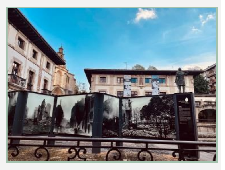
Above: An exhibit outside the Gernika Peace Museum displays images taken in the aftermath of Gernika's bombardment on April 26, 1937.

This year, civil society organisations in Gernika hosted their 34th annual Culture & Peace Convention, alongside a full schedule of public