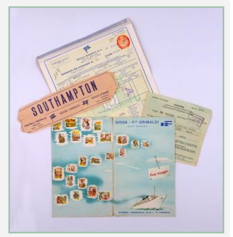
Boat Travel Documents.