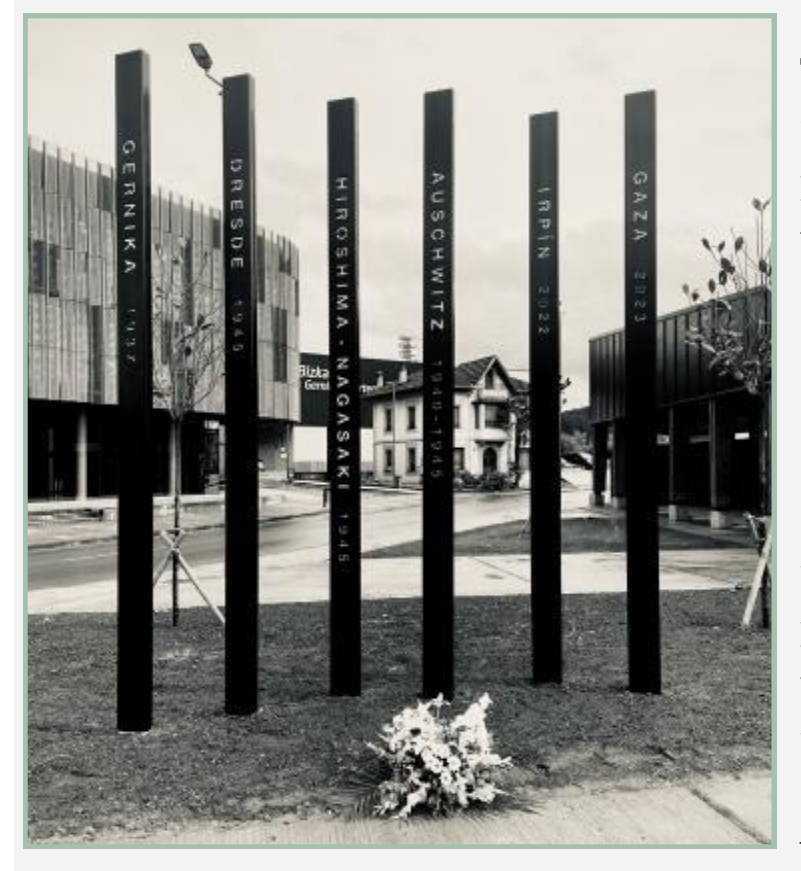
Above: A monument in Gernika connects the destruction of the town to other infamous occasions of mass violence against civilians.

events and ceremonies surrounding the anniversary of the bombardment on April 26th. I was fortunate enough to attend both the conference and the commemorations as part of my background research for Gernika as Orient: Bombs, Art & Fake News, which is based at the CHRC, and funded by both the British Academy and the European Commission. The Culture & Peace Convention, 'Cartographies of Future Te-