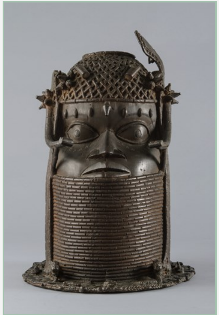
Uhunmwu-elao, lost-wax cast commemorative head of an Oba, used to support a tusk on an ancestral altar. Benin Kingdom, Edo State, Nigeria. 18th-19th century. MAA E 1900.98.2.

To provide context to the Benin Bronzes, it is essential to understand the history of the Benin Kingdom. Dating back to at least 1,200 BCE, this kingdom's territory expanded across modern-day Nigeria, specifically the Edo state. The Benin Kingdom was multicultural and multilingual, eventually forming the Edo people. It was led by an Oba, or king; this period, beginning in the 15th century, saw increased social stratification, building of new palaces, and the solidification of spiritual,