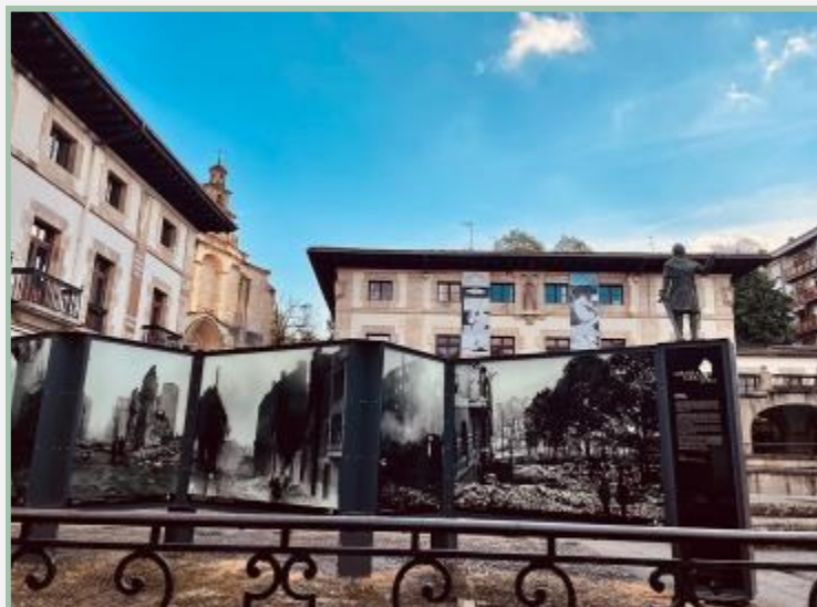
Above: An exhibit outside the Gernika Peace Museum displays images taken in the aftermath of Gernika's bombardment on April 26, 1937.

This year, civil society organisations in Gernika hosted their 34th annual Culture & Peace Convention , alongside a full schedule of public