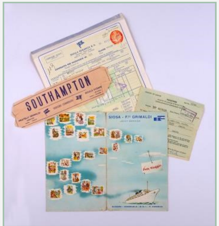
Boat Travel Documents.